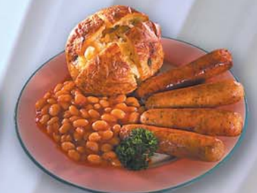
Pork Sausages Kids favourite