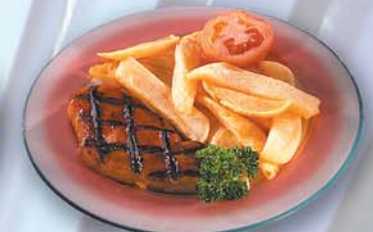
Pork Loin Plain, Teriyaki, BBQ or Char Sui