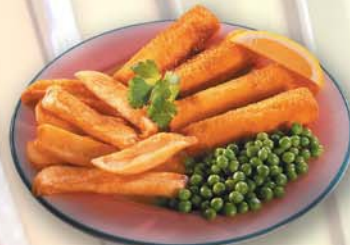
Fish Fingers Traditional Favourite