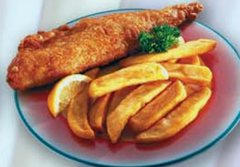
Fillet of Fish Delicious White Fish (May contain small bones)