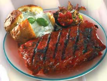
Damon's Ribs Available BBQ or Char Sui

(**Excludes Burgers, American Hot Dog & Pizza. Not available as Kids Eat Free)