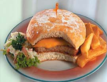
Sausage Burger With Cheese if you wish