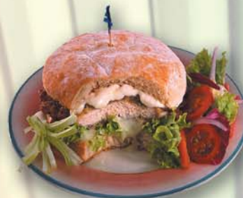
Chicken Burger Southern Style Coating with Honey Mustard