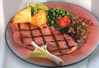
Gammon Choice, Cut, Char grilled