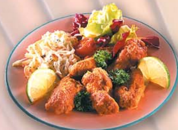
Chicken Wings Plain, Buffalo, Teriyaki or sweet & Sour