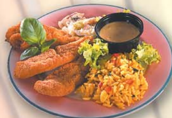
Chicken Tenders Tender Breaded Chicken