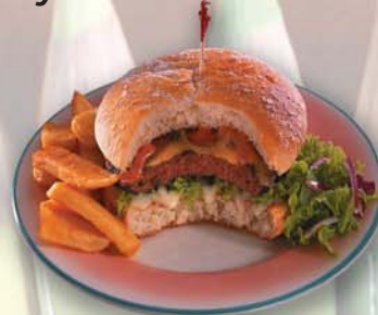
Damon Burger With Relish. Plus Cheese if you wish