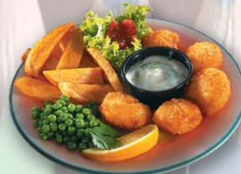
Scampi Tender & Succulent