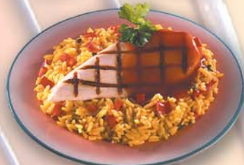
Chicken Breast Plain, Teriyaki, BBQ or Char Sui