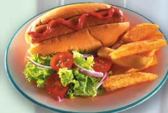
American Hot Dog With fried onions if you wish